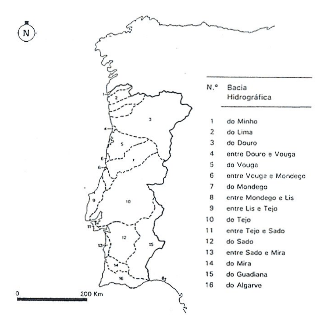
Figure 2. Main catchment areas in Portugal

Sites will be selected in order to assure a national geographical coverage and the "representativeness" of the multiplicity of habitat types (river, stream, marsh, dam, etc.). All catchments will be considered (Figure 2). In larger catchments one site per 1000 km² of catchment total area will be analysed and in smaller catchment areas at least one site would be considered Sites are not randomly selected but weighed in terms of representativity of each catchment characteristics.