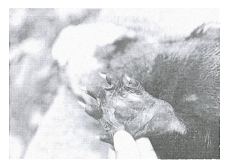
Figure 2. Fore foot of the hairy-nosed otter showing the interdigital pads