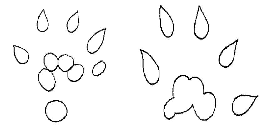
Figure 4: Fore left and hind left track from the plastercast