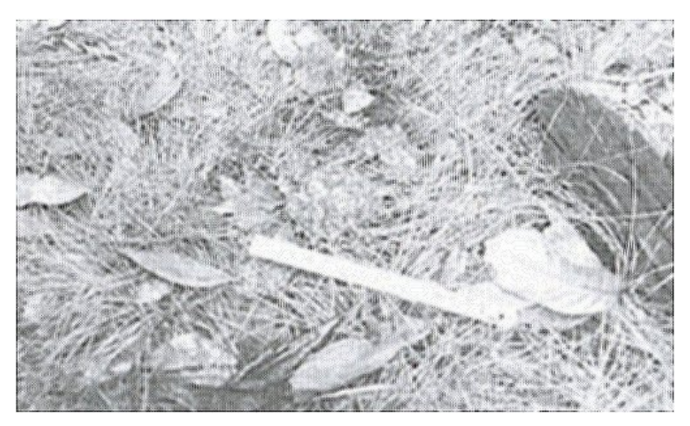
Figure 5. Shapeless dropping of the hairy-nosed otter