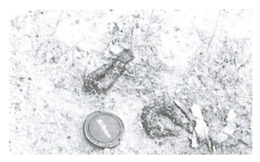
Figure 6: Cylindrical dropping of the hairy-nosed otter