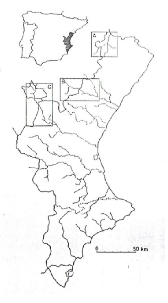
Figure 5: Study Area in Valencia