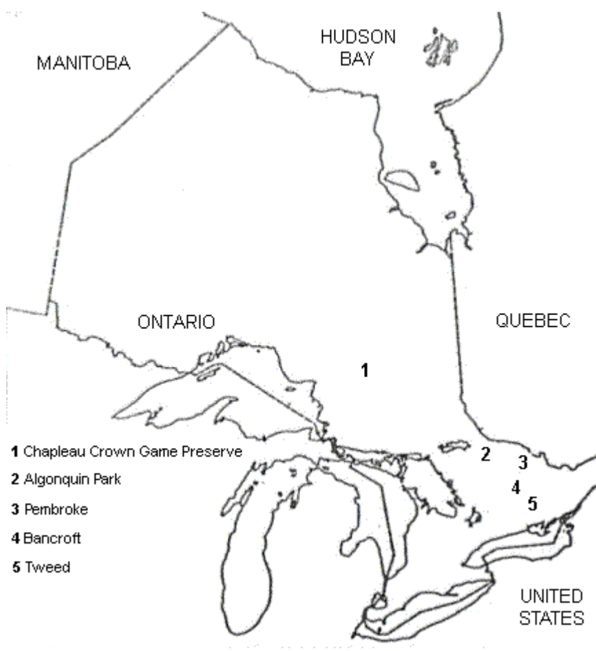
Figure 1: Otter Trapping Locations

In 1985 and 1986 an otter biologist with live-trapping experience was hired, in addition to enlisting local help. Financial assistance was received from the Wild Turkey Trust Fund administrated by the Ontario Federation of Anglers and Hunters. In 1986 the trapping efforts were financed primarily through the same trust fund. Workshops outlining the logistics and general procedures involved were conducted for local trappers. The importance of checking live traps at least once a day was emphasized. The average number of recorded trap nights required to capture one otter in Algonquin Park was 122.