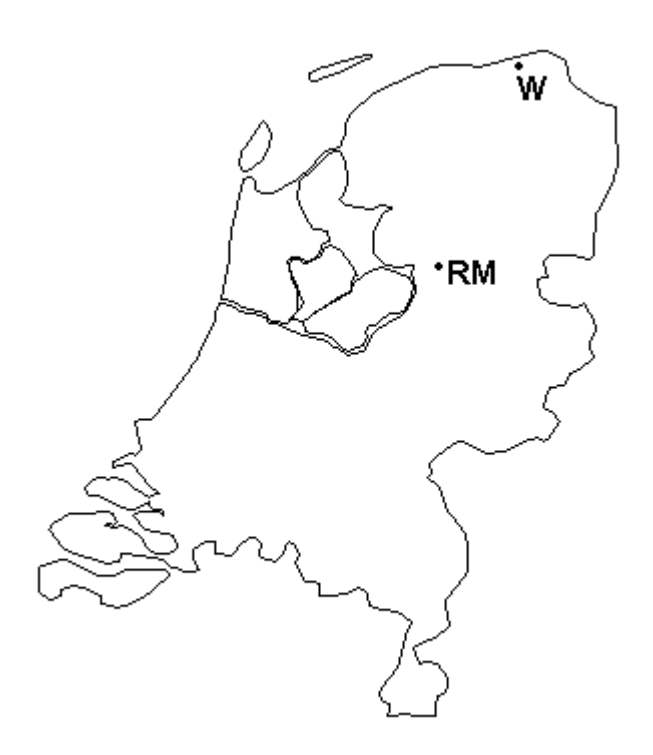
Figure 3: Locations at which Otters were found

• a probably first year male, found dead in February 1986 in the same peat-bog reserve Rottige Meenthe.