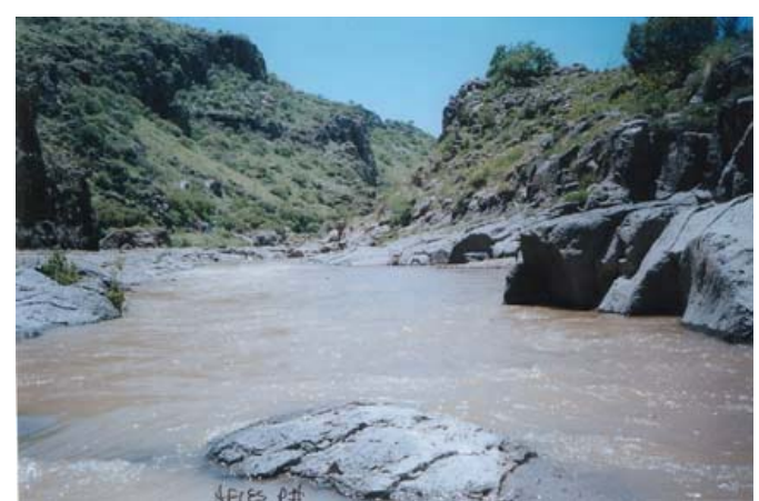
Figure 2. Deep pool and latrine (bottom centre) used by otters.

Differences between used (n=21) and random sites (n=25) were significant (P < 0.10; Table 1). Habitat used by otters provided abundant and diverse escape cover when compared with random sites. The used sites were located in areas where large pools with average depths of 0.8 to 1.0 m (90% C.I.) and rock/talus cover within 4.8 to 8.1 m (90% C.I.) were present (Figure 2). Under-story vegetation cover in the used areas was abundant, ranging from 46 to 75 % (90% C.I.) and undisturbed by cattle grazing. Areas where under-story vegetation cover was severely affected by grazing were not used by otters.