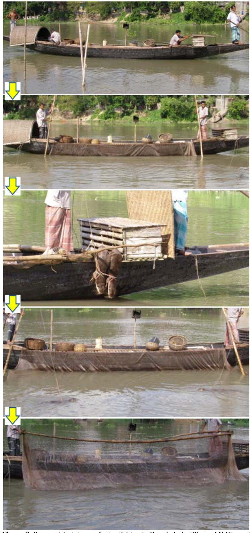
Figure 3. Sequential pictures of otter fishing in Bangladesh.