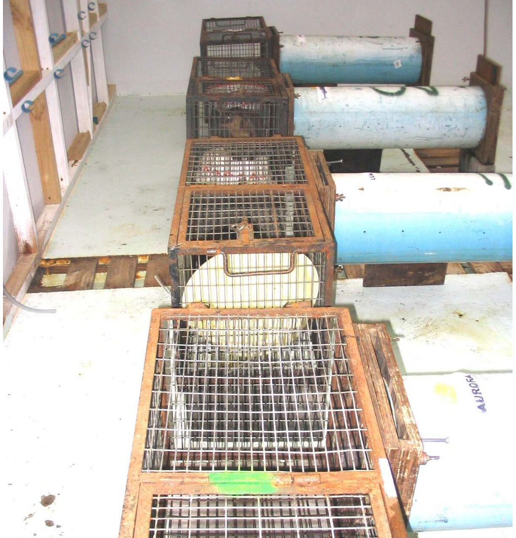
Figure 2. Captive marine otters ( Lontra felina ) individually housed in a quarantine room at the Quintay Marine Research Centre, Universidad Andres Bello.