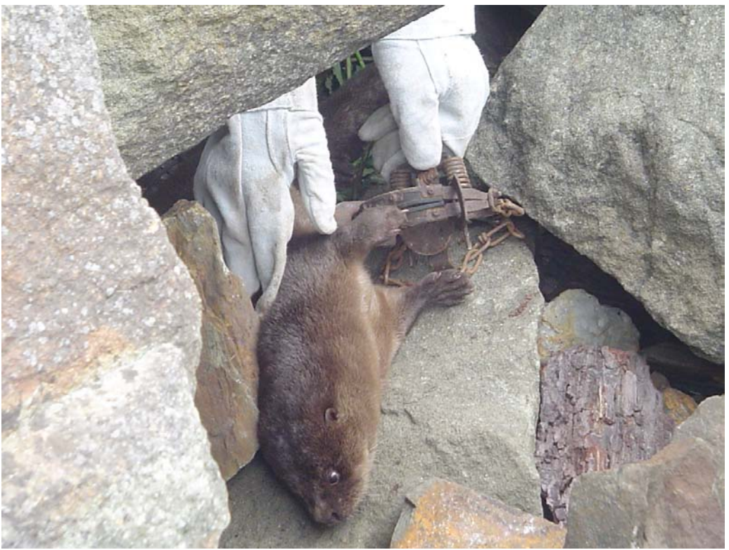
Figure 1. Male marine otter ( Lontra felina ) trapped with a # 1.5 soft catch leg-hold trap in Colcura, VIII Region, Chile. Physical immobilization with the use of leather gloves is performed in order to administrate a combination of ketamine and medetomidine i.m. by hand syringe.

(two males and one female) died within three and six days after capture. One of these otters did not accept any food offered, while the others ate only partial rations. On the day of death all otters (two kept simultaneously), developed an acute, black and smelly diarrhoea. At the post-mortem examination, it was diagnosed an ulcerative gastritis, acute in the two males and moderate in the female (Table 1). Citrobacter freundii and Citrobacter sp. were possible to isolate from the gastric content of the two most affected otters.