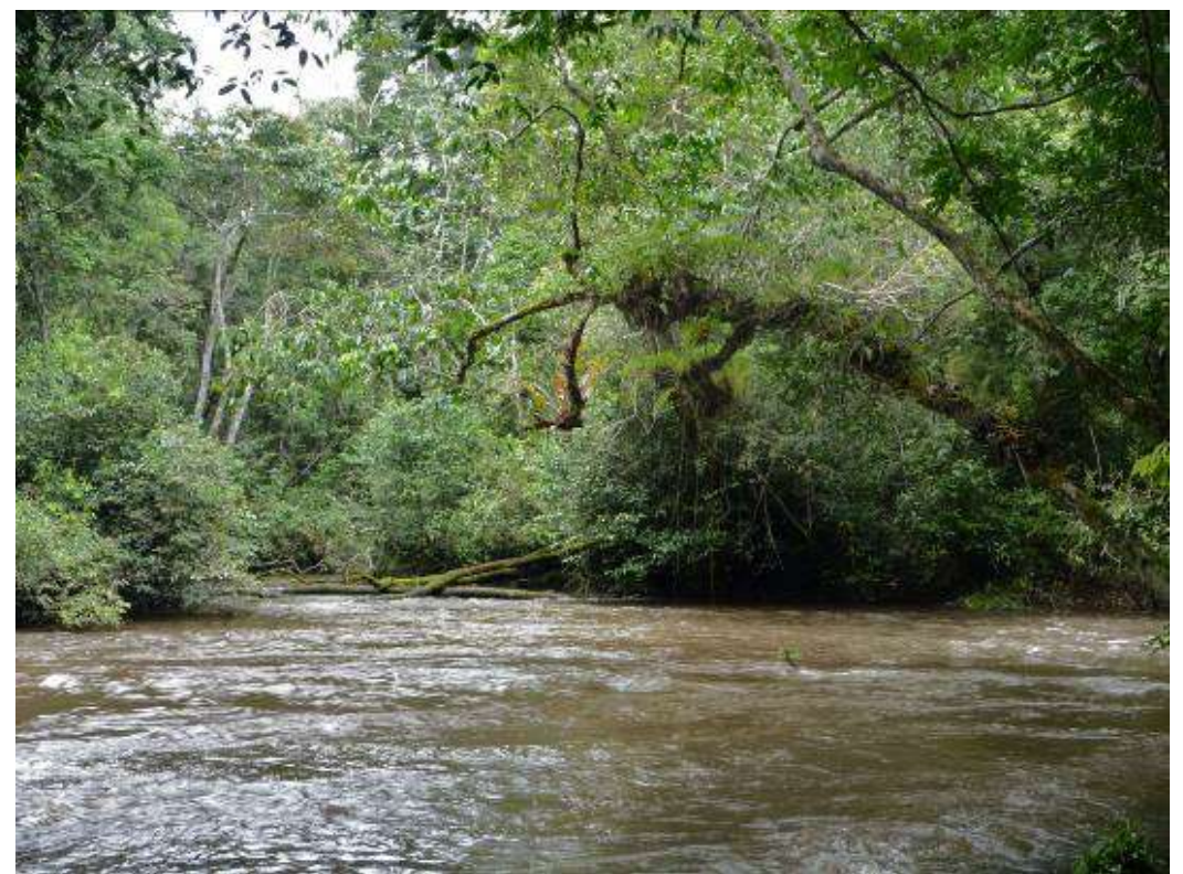
Figure 2. The Dji Dji River, July 2010 (photo by LCD).