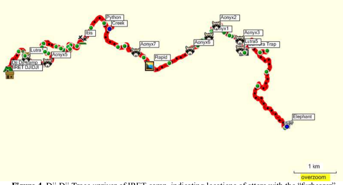
Figure 4. Dji Dji Trace upriver of IRET camp, indicating locations of otters with the "furbearer" symbol (Garmin Mapsource). The trace followed 15.6 km of river one-way.

The results of our 7-day expedition demonstrated a high local abundance of both species of otters, particularly upriver of the IRET camp (Table 1 and Figures 4 & 5). At least one otter was sighted every day in 2010, and we observed a mixture of solitary animals (presumably solitary males or juvenile females) and groups of 2. If we assume that we observed new individuals at each GPS point where otters were seen (but the same individual when revisited), then we observed 7 LM (in 5 sites) and 11 AC (in 7 sites). Some animals were spotted for very brief periods, and we could not identify individuals by their head and throat markings. We therefore expect that at least some of these sightings were repeated viewings of the same individuals, particularly upriver of the rapids where AC was most common (Figure 4). Otters were only spotted in the daytime, in spite of several opportunities to view them at night. One 2-h nighttime survey of the upriver portion of the river up to a major Rapid ("Rapid" in Figure 4) was undertaken (by LCD) in addition to daytime surveys, but no otters were spotted. Neither was any otter spotted by a crocodile researcher working for several hours every evening in the area concurrently with our study (M. Shirley, pers. comm.). It therefore appears that in this region, both otter species are largely diurnal.