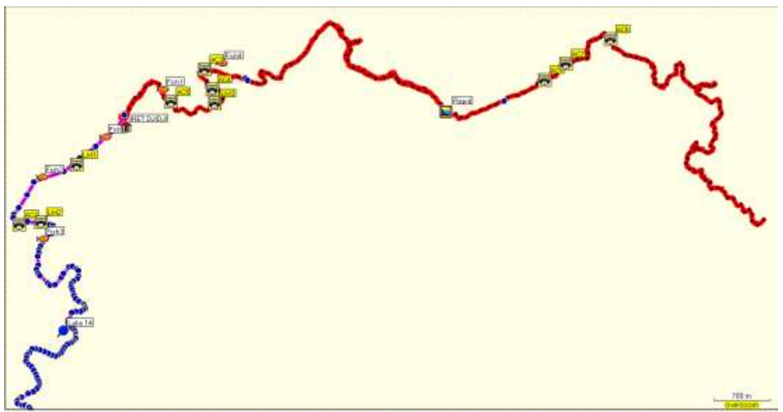
Figure 6. Otter sightings upriver of Iret Camp, 2011. Locations of otter sightings noted with the "furbearer" symbol (Garmin MapSource).