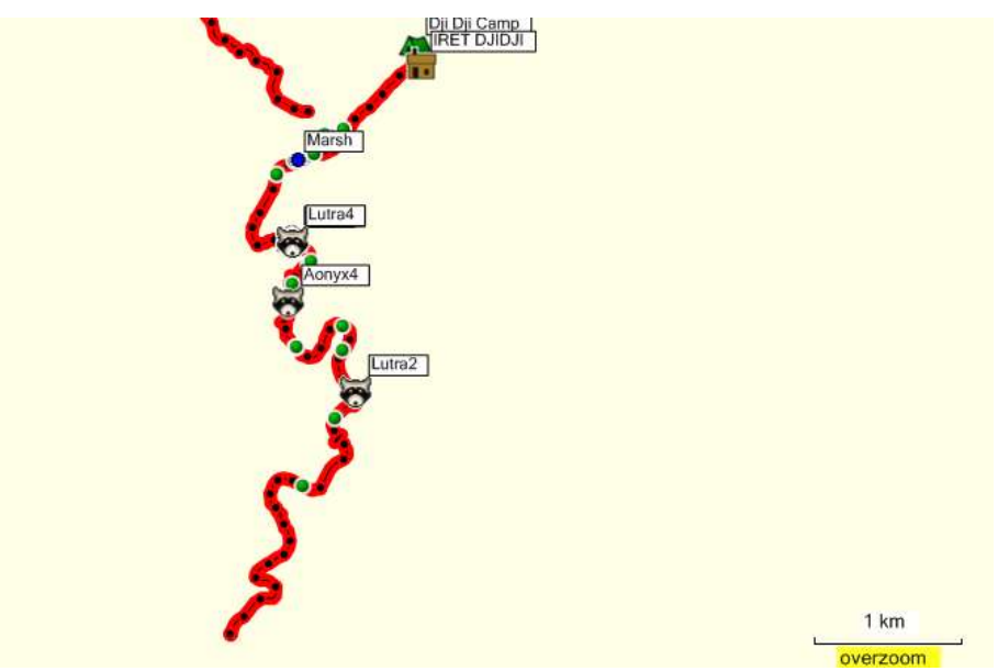
Figure 5. Dji Dji Trace downriver of IRET camp, indicating locations of otter sightings with the "furbearer" symbol (Garmin MapSource). The trace followed 10.0 km of river one-way.