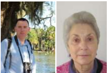
(Received 10<sup>th</sup> June 2013, accepted 16<sup>th</sup> June 2013)

<sup>1</sup>RSPCA Wildlife Department, Wilberforce Way, Southwater, West Sussex, RH13 0AE, UKS <sup>2</sup> BCES-Modelling, Modelling Suite, School of Biology, Ridley Building, Newcastle University, Claremont Road, Newcastle Upon Tyne NE1 7RU