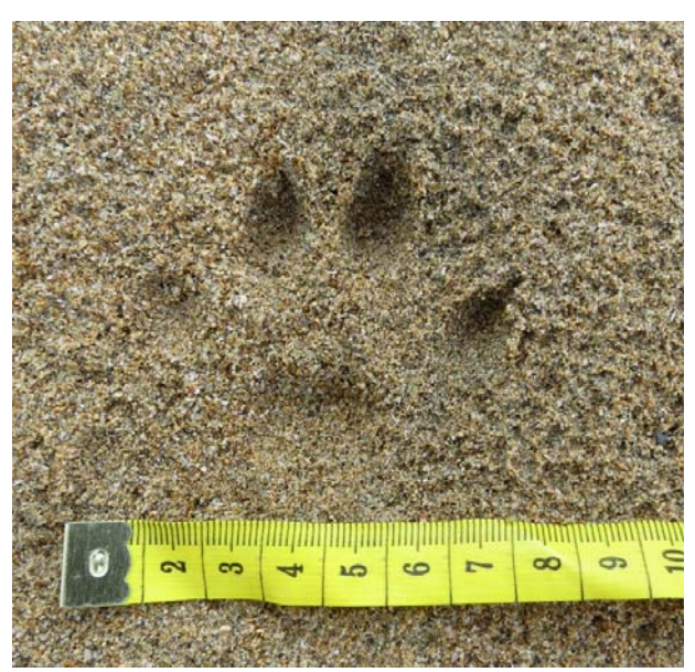
Figure 3. Forefoot print made by L. sumatrana during the observation.

The firm sand did not yield good prints, but one impression of a forepaw had a width of 57mm and a length of 59mm (Figure 3). Only four toes were visible. The largest toe had a width of 10mm and the pad with was 21mm. In the fairly symmetrical print the claws were distinct but the interdigital webbing was not visible. Kanchanasaka (2001) reported average forepaw track widths of 58mm from a sample of 23 observations.