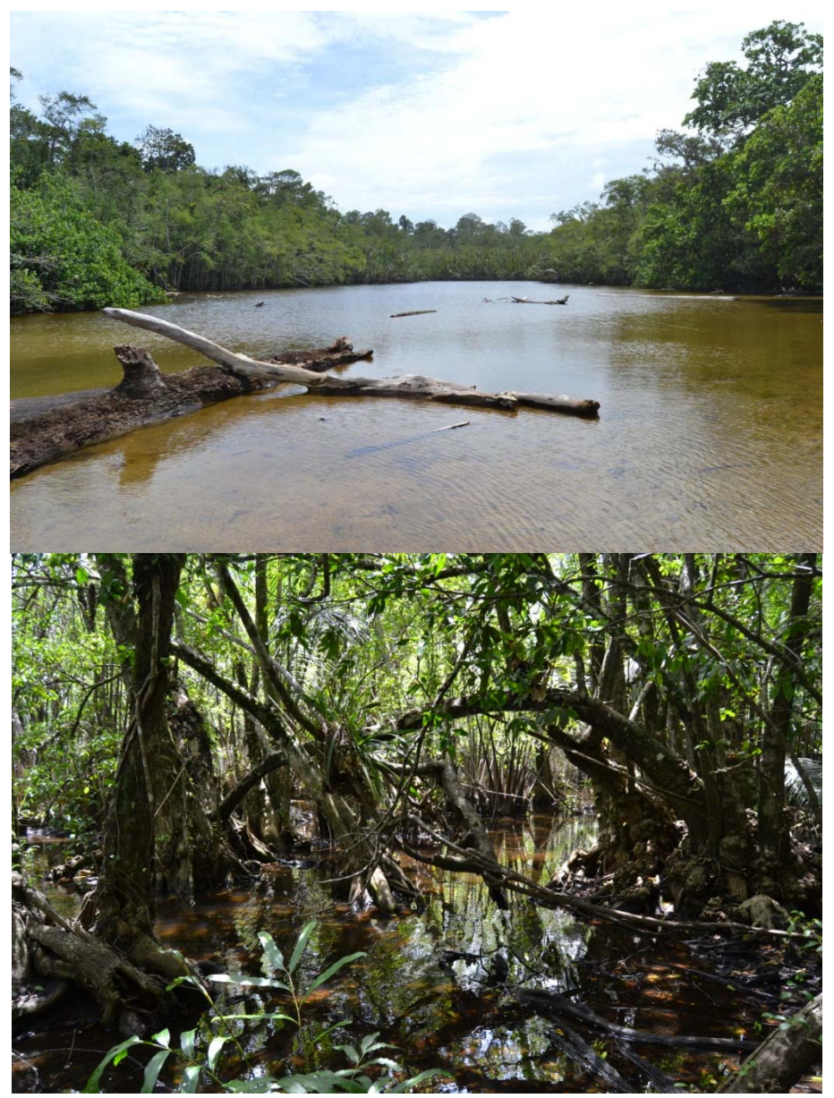
Figure 4. The habitat where the otter was observed (above): the estuary mouth closed by a sand bank and (below) the mangrove swamp further upriver.

The habitat around the estuary is flooded swamp dominated by nypa palm ( Nypa fruticans ) and mangroves ( Bruguiera sp., Avicennia sp.) with banyans ( Ficus microcarpa ) palms ( Pandanus tectorius ) and baringtonia ( Baringtonia asiatica ) also present, consistent with previous observations of L. sumatrana , which have mostly been made in swamps and flooded lowland forest (Wright et al., 2008) (Figure 4).