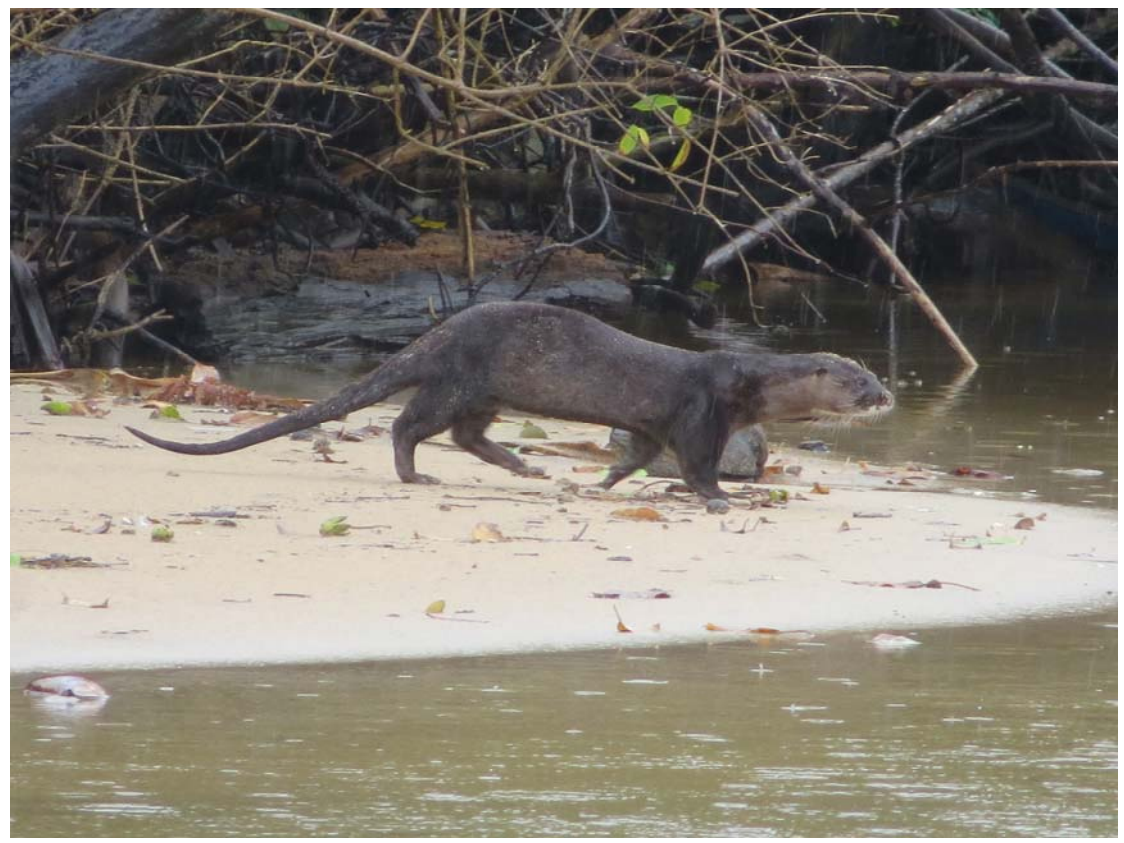
Figure 2 . Lutra sumatrana in the Cukuh Babui estuary, Tambling Wildlife Nature Conservation, Bukit Barisan Selatan NP. The otter's characteristic hairy rhinarium and striking white patches on lower lip seen here clearly distinguish the animal from Lutra lutra .

The firm sand did not yield good prints, but one impression of a forepaw had a width of 57mm and a length of 59mm (Figure 3). Only four toes were visible. The largest toe had a width of 10mm and the pad with was 21mm. In the fairly symmetrical print the claws were distinct but the interdigital webbing was not visible. Kanchanasaka (2001) reported average forepaw track widths of 58mm from a sample of 23 observations.