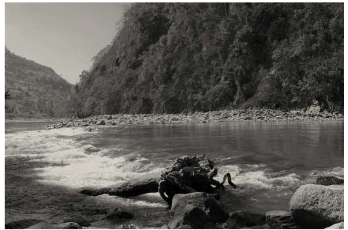
Figure 3. Lower gradients in the southern reaches of the Punatsangchhu/Sunkosh River slow and broaden the flow, providing more sandy beaches.