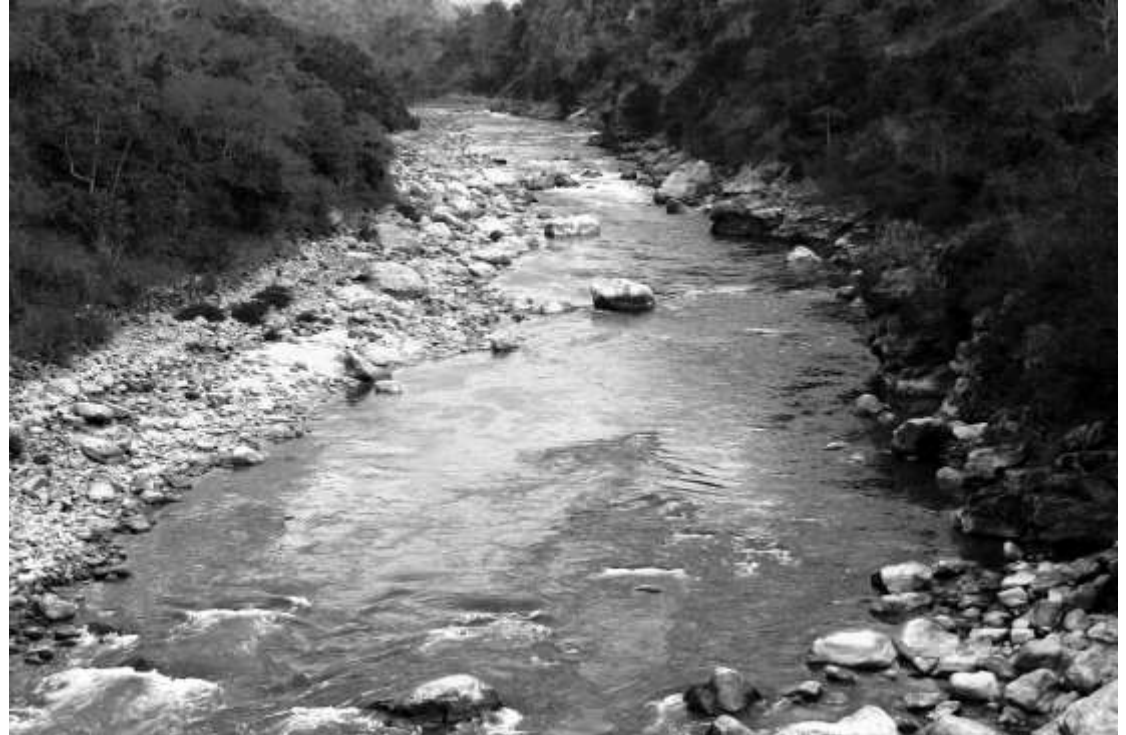
Figure 2. The high-energy Punatsangchhu/Sunkosh River drains a large portion of the high Himalaya, and flows on a steep north-south gradient through narrow valleys.

Forest cover was dominated by temperate broadleaf forest along the upper portion of the study area, dry Chir pine ( Pinus roxburghii ) forests along the middle portion, and subtropical broadleaf vegetation in the lowest portion (Figure 2,3). Annual precipitation varies from 400 to 600 mm in the upstream section, 700 to 900 mm for the midstream region and more than 2000 mm in the southernmost region (Choden, 2009). No transects were located close to the two hydroelectric facilities and dam under construction, where the river is currently diverted from its channel.