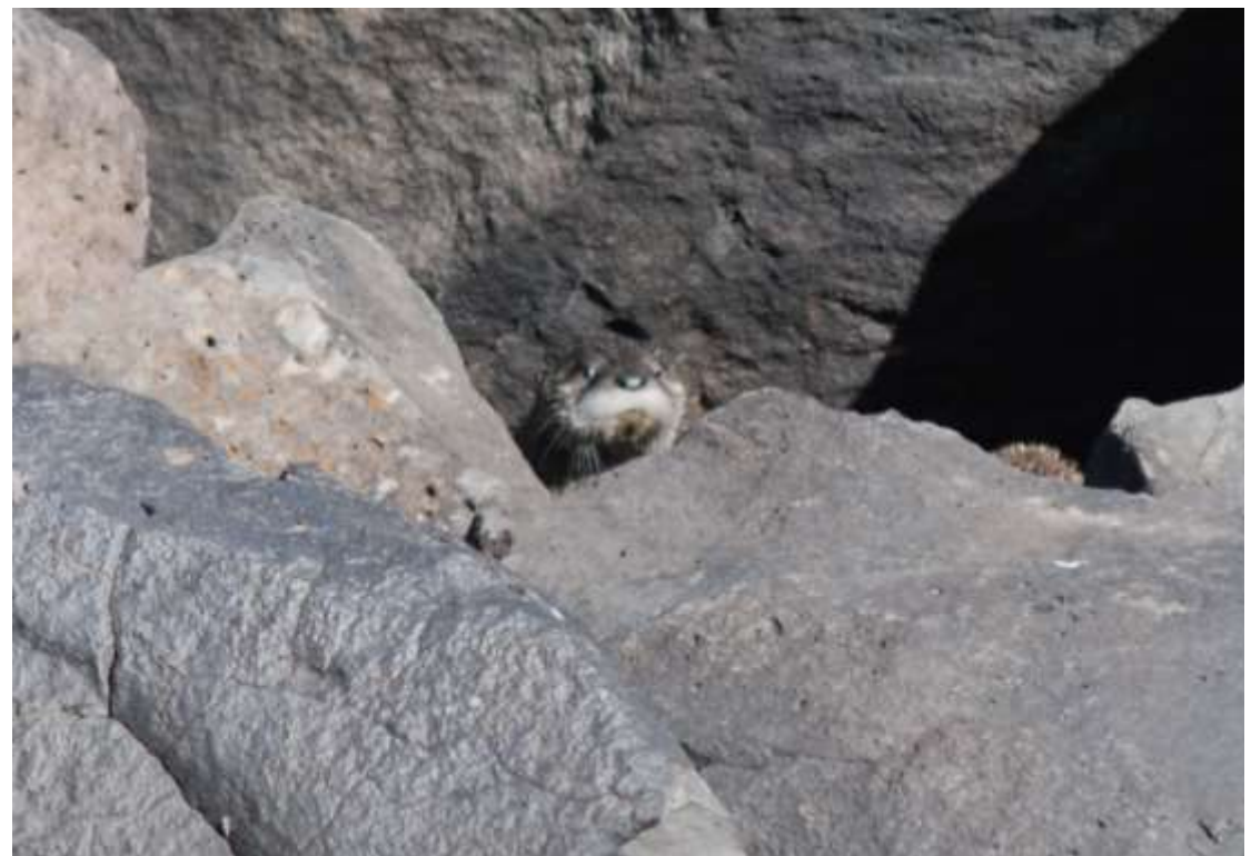
Figure 3: Juvenile otter in Orilla Verde Recreation Area, June 2013. Note the lighter-colored adult otter hidden slightly in the rocks to the right.

site of the first observation. The otters were again standing on rocks adjoining a sheer bank below a small set of rapids. We had not yet set up our camera due to the rapids. The adult startled upon sighting us, and grunted at the pups. The otters dove into the water and fled the area before we could manage to photograph them. The area was monitored carefully on future surveys, but since the site was located directly across the river from a popular campground, we considered it unlikely that this was a regular shelter site for otters given their flight response in the presence of humans.