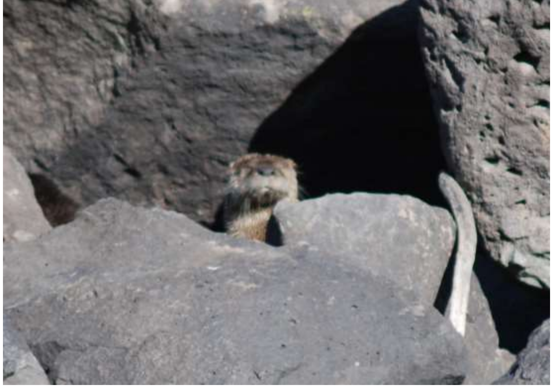
Figure 2: Adult otter in Orilla Verde Recreation Area, June 2013. Note the darker-colored pup hidden slightly in the rocks to the left.

We observed an adult and two young on one more occasion on June 22, 2013, just below Taos Junction Bridge (N 36 20.082', W 105 44.135', +/- ?m). Though there was one fewer juvenile present than in the group observed the week before, we presume that it was the same family group due to the relatively short distance from the