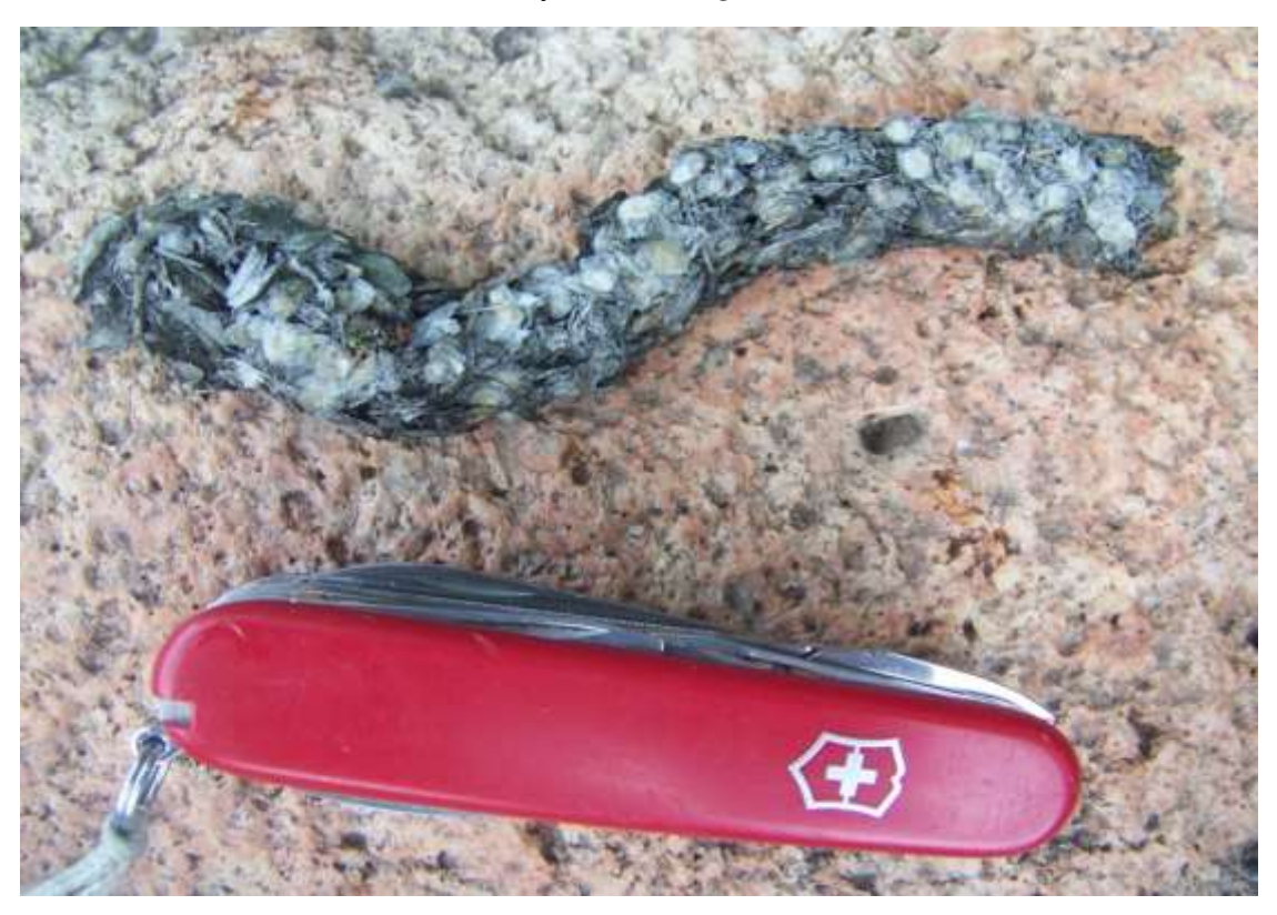
Figure 4. Scats of L. longicaudis in the Choluteca River, Honduras.

scats were mostly dry and were identified according to the description provided by Aranda (2000), with most being composed of bones and fish scales. No dens were located; however, on the banks of the river there are tree roots that have cavities that could be used as dens: Pardini and Trajano (1999) found that caves under tree roots were one of the most used shelters by Lontra longuicaudis in southern Brazil.