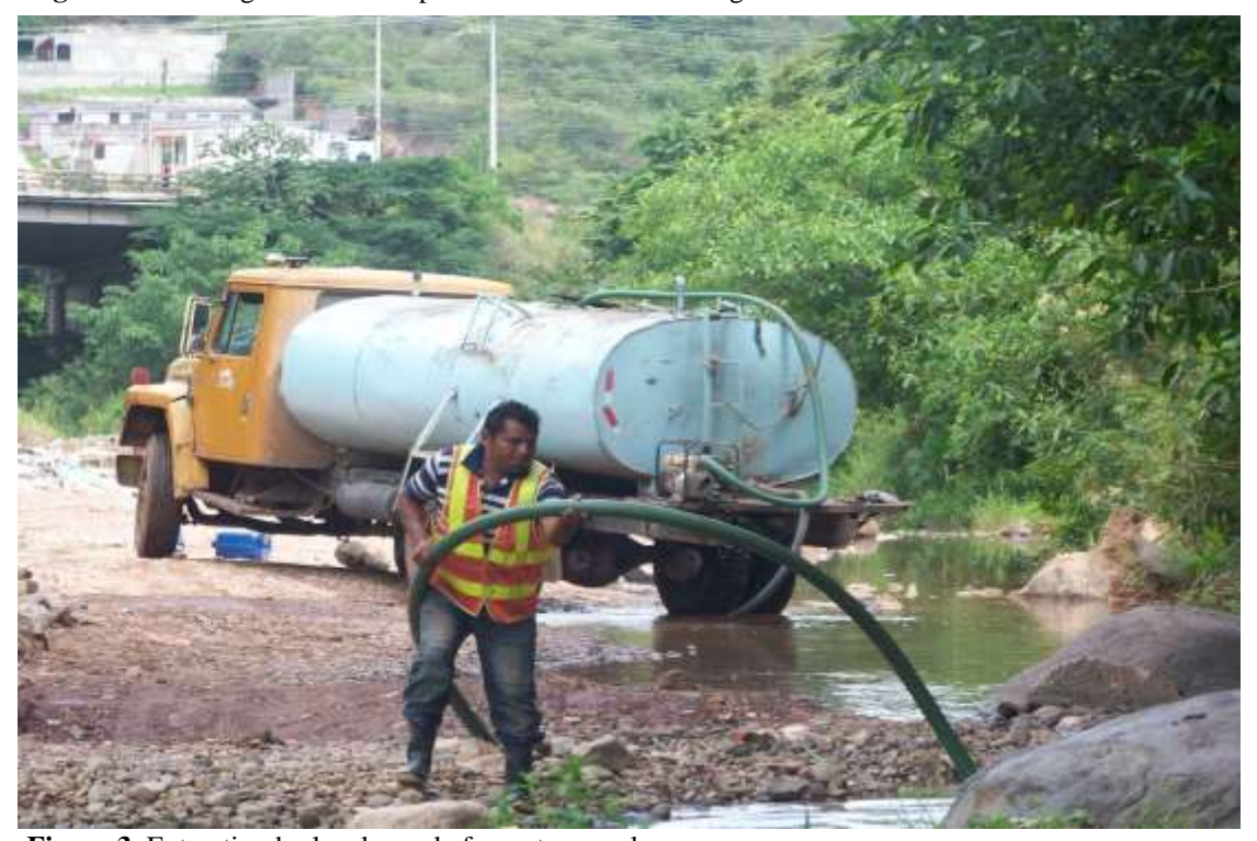
Figure 3. Extraction by local people for water supply.

On June 12, 2014 we conducted field surveys to locate tracks, scats at latrines, and dens to determine if a population of Neotropical river otters was well established in the area where the carcass was collected. We also conducted interviews of residents to determine if they could provide evidence of the species occupying the area. During surveys we located 37 scats among five latrines, which were found on rocks jutting out of the river, over a total of 130m of the same stretch of the river. The spraints were distanced between 15 m - 20 m. The largest number of scats found at one place was seven and the lowest was three; the size of scats averaged 8 cm (Figure 4). The