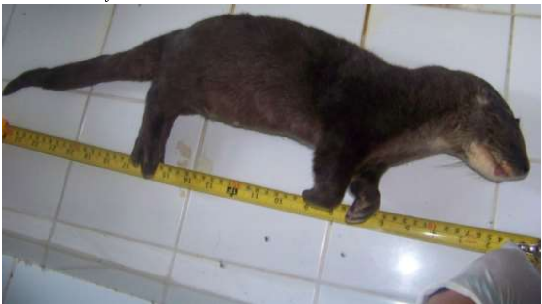
Figure 2. Handling of the Neotropical otter for size and weight measurements.

activities such as roads for livestock and laundry by local communities. Despite human influence, riparian vegetation structure is still present, and the river contains rocks located adjacent to its banks.