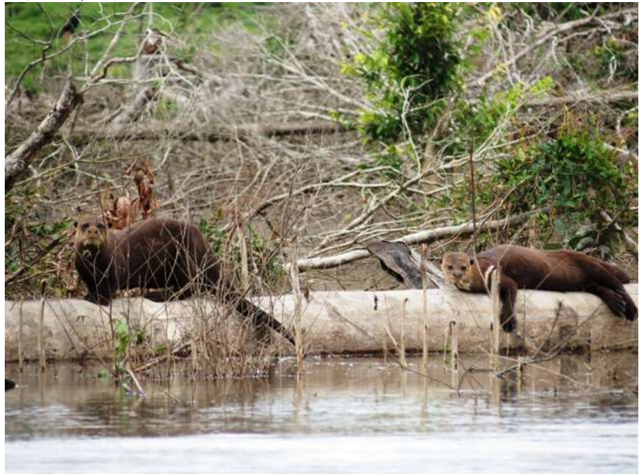
Figure 3 . Two of the three individuals recorded resting on fallen tree trunks near the riverbank areas that had been cleared for the construction of the Teles Pires reservoir, Mato Grosso.

A group of three individuals were observed resting on fallen tree trunks in the eighth campaign (rainy season), held in March of 2014 (Fig. 3). This observation indicated a possible return of otters to the site. Generally, the number of records drops considerably during this seasonal period because of the expansion of the species' home range into the creeks and the rising of water levels covering dens and banks (Duplaix, 1980).