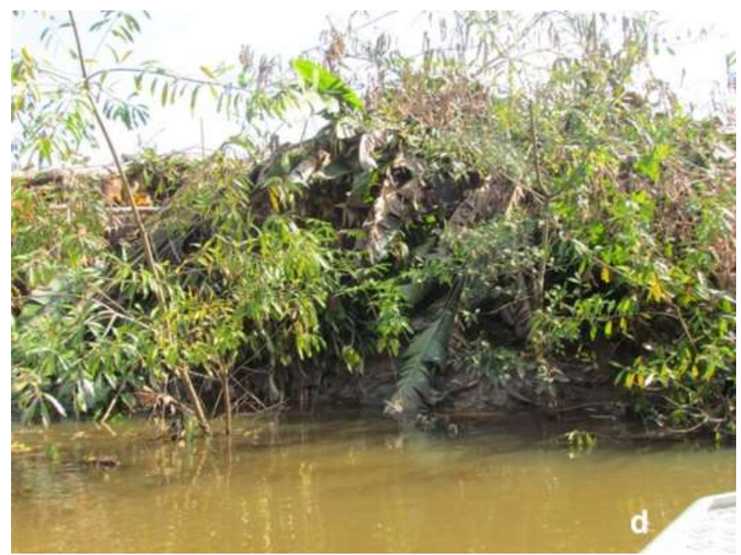
Figure 2. Paranaíta riverbank before (a) and after deforestation (b), one of the dens recorded in the previous period (c), same den after being destroyed with the overthrow of the riparian vegetation (d) for filling the Teles Pires reservoir in Mato Grosso.

A group of three individuals were observed resting on fallen tree trunks in the eighth campaign (rainy season), held in March of 2014 (Fig. 3). This observation indicated a possible return of otters to the site. Generally, the number of records drops considerably during this seasonal period because of the expansion of the species' home range into the creeks and the rising of water levels covering dens and banks (Duplaix, 1980).