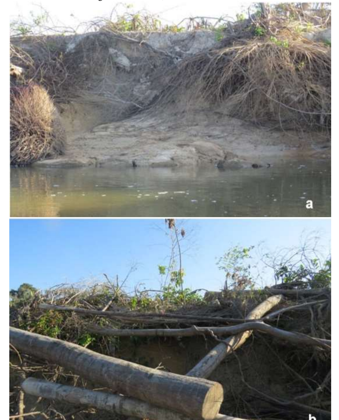
Figure 4. Resting area (a) and dens (b) built on cleared banks of the Paranaíta River, Mato Grosso.

The ninth campaign, performed in June of 2014, was characterized by receding waters. All dens that had been destroyed or obstructed were rebuilt in the same location, indicating fidelity to the den sites, and the increase in dry areas, exposing extended bound areas, allowed the construction of several new dens along the river as well as active resting places and campsites (Fig. 4). In the subsequent campaign, the last one before the filling of the reservoir, these dens were still active.