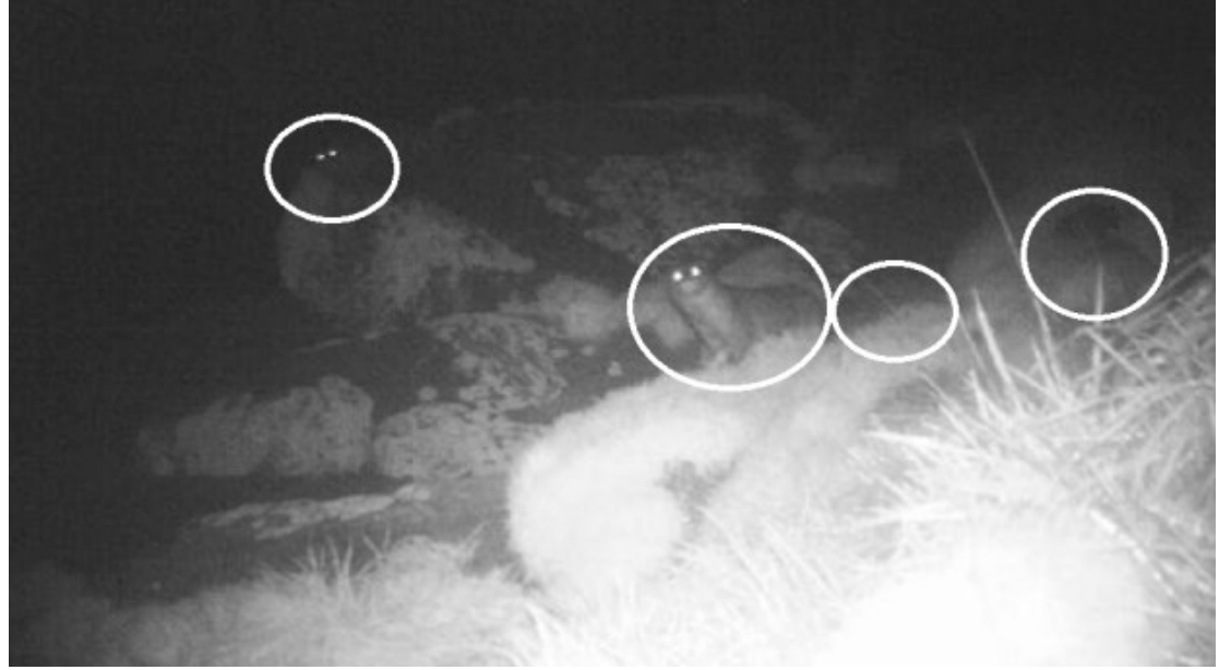
Figure 5. Video detail with a group of 4 otters, 2 small cubs and 2 adults (San Martiño island, Cíes, March 2015).

Of a total of 217 events in which otters were detected, 83.4% corresponded to single individuals classified almost all of them as adults, while the remaining 16.6% corresponded to groups of 2 to 4 individuals. The group that accumulated a greater number of events was formed by 3 otters (Figure 4), followed by the groups formed by 2 and 4 otters respectively (Figure 5). By counting only the events with several individuals (n = 35), the mean size of these groups was 2.6 individuals ( \pm 0.608 sd.; n = 35). The mean litter size was estimated at 1.77 individuals ( \pm 0.426 sd.; n = 35). It should be noted, however, that most of the events recorded may correspond to the same litter, and counting only the maximum number of cubs detected in each of them, the average litter size for the total of the islands would be 1.89 \pm 0.33 (sd., n = 9) (Table 3).