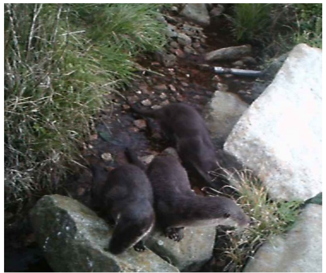
Figure 4. Video detail with a group of 3 otters, 2 large cubs and 1 adult (San Martiño island, Cíes, April 2017).