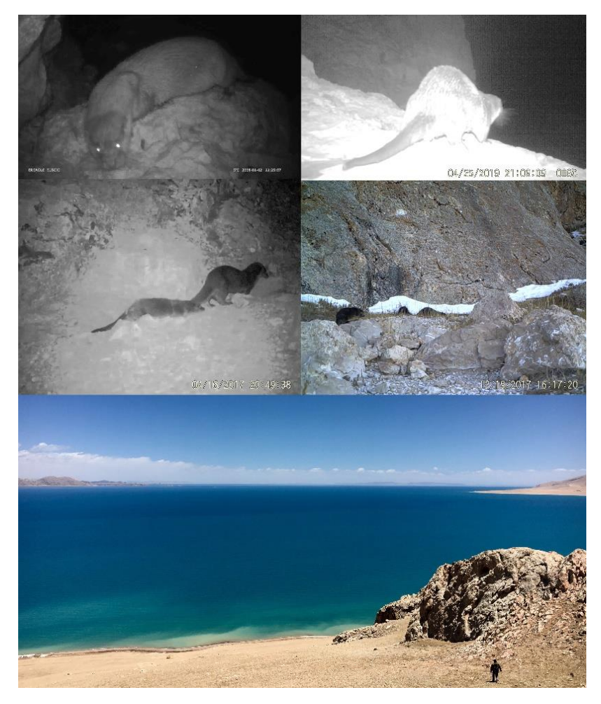
Figure 2. Images of the Eurasian otters recorded by Siling Co and the landscape of the lake

According to our knowledge to date, our findings provide the first verifiable evidence of the Eurasian otter's distribution in a closed drainage with saline water, among the highest altitudinal presence records of the species across its known global range (Liu and Yin, 1993; Smith and Xie, 2010; Editorial Team for the Report on Otter Investigation and Conservation of China, 2019). Geoscience studies have suggested that the Siling Co basin separated from other drainage systems at a minimum distance of 150km (i.e. the Nam Co lake) since about 30ka B.P., which implies that the local otter population may have evolved independently at least during Holocene and achieved adaptive biological characteristics to survive in low oxygen and saline environment (Zhao et al., 2011; Crait et al., 2012). Therefore, this population's bio-physiology, ecology and evolutionary history warrant deep study in an interdisciplinary manner, to contribute new insights to the species and the ecosystems it within.