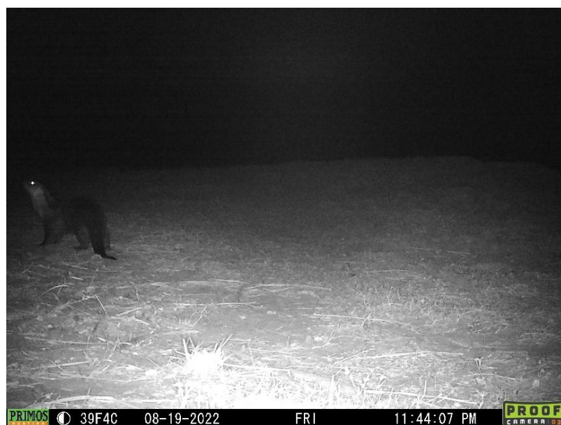
Figure 2. Image of an African clawless otter captured by one of the camera traps in 2022.

The 40 camera traps recorded a total of 42,256 images. Three African clawless otter encounters were photographed (see Fig. 2). No spotted-necked otters were photographed. This resulted in a calculated RAI of 0.31 for African clawless otters in Bwabwata National Park.